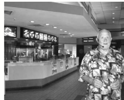
Pastor prepares to teach at Ariel Chapel in the Robinson Crossings Theater in Norman.