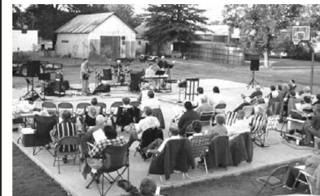
Revival In Morrison, Oklahoma

KMSI ---88.1 FM, OKC, Ok KNYD ---90.5 FM, Tulsa, Ok KOZO ---89.7 FM, Branson, Mo WOKN ---88.7 FM, Canton, Ok WYCF ---91.5 FM, Hampton, Va KCNW ---1380 AM, KC, Mo Air Time - 9:45 A.M. WLMR ---1450 AM, East Tn. Air Time - 7:00 A.M.